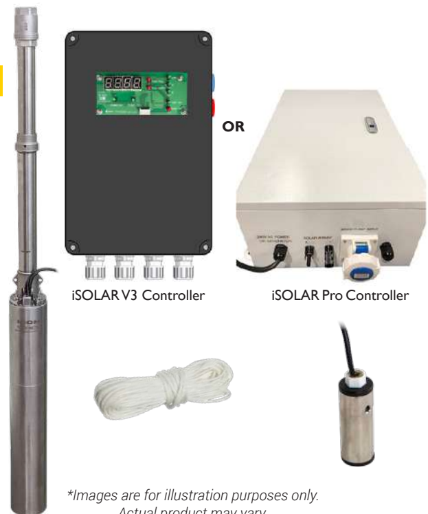
*Images are for illustration purposes only. Actual product may vary.